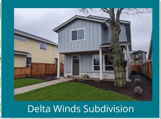
Delta Winds Subdivision