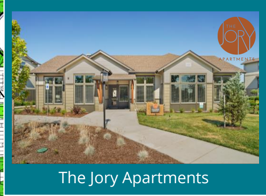
The Jory Apartments